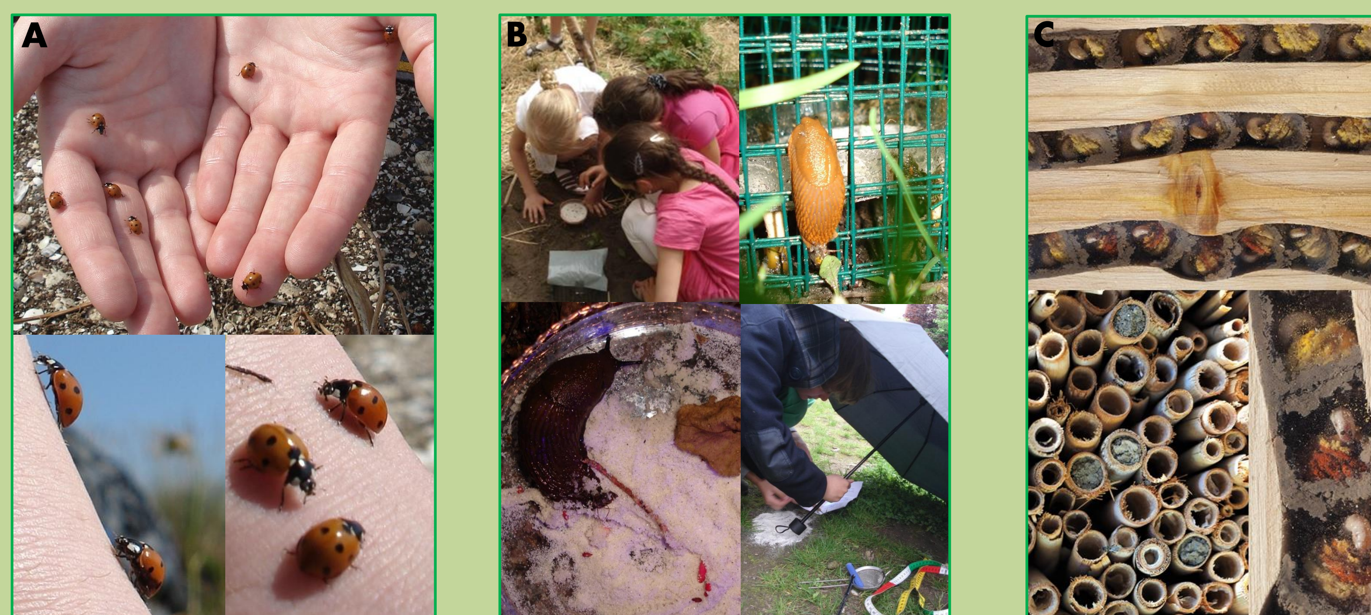
Figure 2. Different examples for a practical citizen science approach combining effective environmental education and research in natural and educational sciences (A) evaluate an existing project about changing lady bug compositions (B) continue a successful research project on slug defence (C) develop a new project investigating trap nests from different geographical regions.